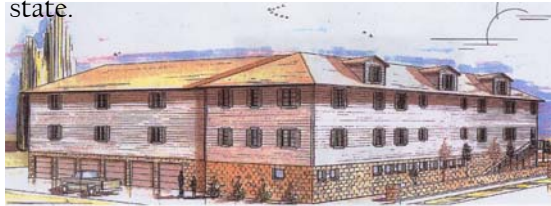
Graceland Manor Apartments, 6859 N. 43rd St., Milwaukee