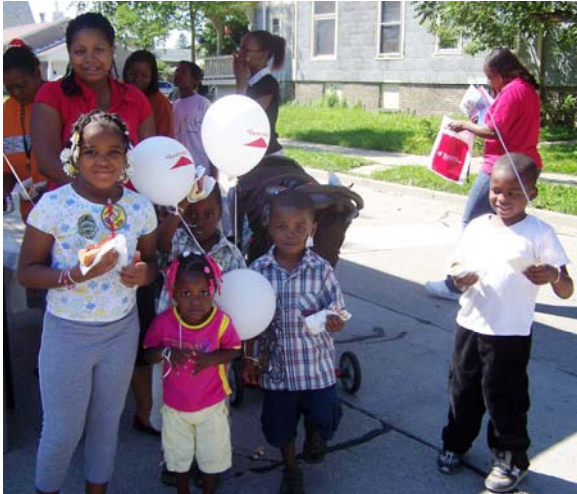
The Salvation Army, which provided free hotdogs, and a local barbershop were among the organizations participating in Mt. Horeb's community outreach event.

The Mt. Horeb church in Milwaukee hosted a community outreach event on Saturday, September 1, which featured, among many other things, healthcare screenings and entertainment for children. The event involved numerous social-service agencies and advocacy groups, organizations like the Cub Scouts, and the Salvation Army, which provided free hot dogs. Free