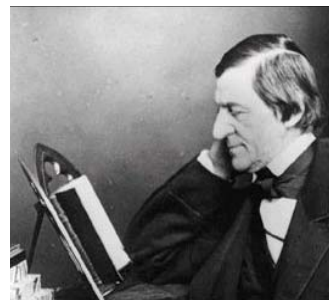
Ralph Waldo Emerson