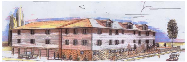
The Graceland Manor Apartments, 6859 N. 43rd St. in Milwaukee, offer adult living for those 55 and older. All apartments are furnished with ceiling fans, refrigerator, stove, dishwasher, and garbage disposal. For safety, each unit is equipped with a fire alarm and a sprinkler system. Rates begin at $645/month.